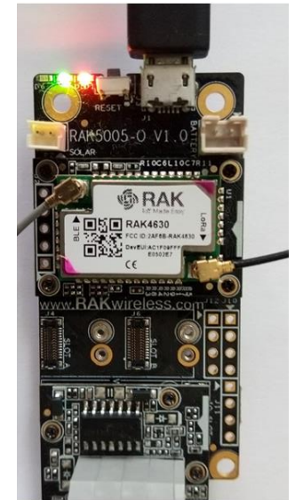
RAK 4631 WisBlock