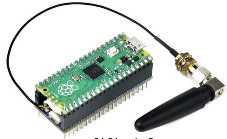
Pi Pico LoRa